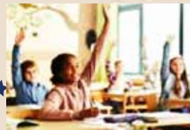
Movie 3 - Hint: Steve Coogan