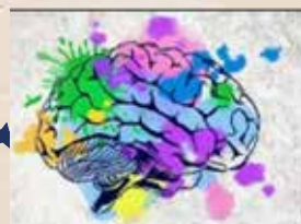
Movie 4 - Hint: Russell Crowe