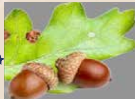
Movie 2 - Hint: Ken Loach