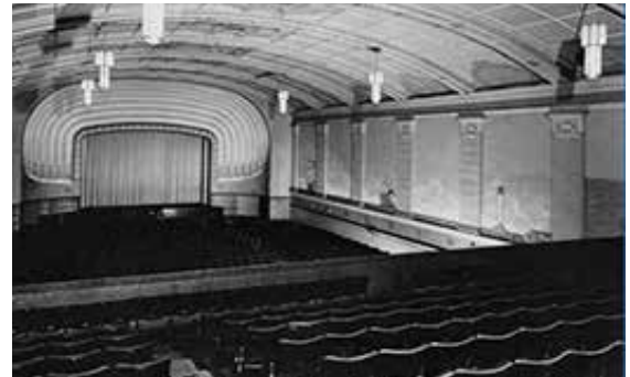
Hoyts Shore Cinema Auditorium