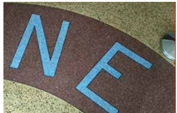
Sun Cinema floor tiling