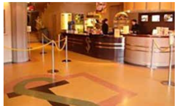
Sun Theatre Foyer