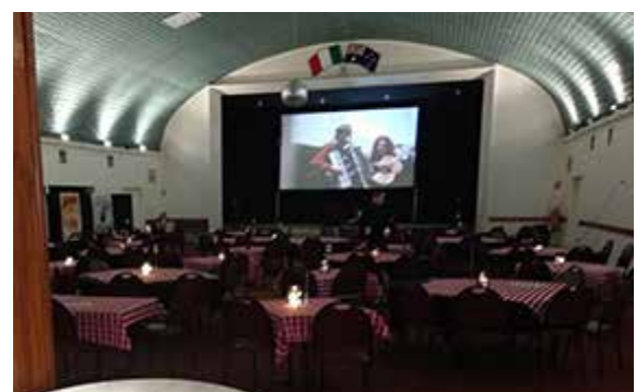
Italian Social Club interior nowadays