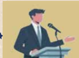
Movie 1 - Hint: Colin Firth