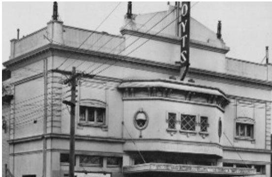
Williamstown Picture Theatre/Shore Cinema/Hoyts Shore Cinema