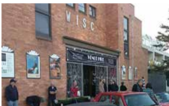
Williamstown Italian Social Club