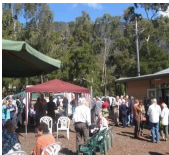
Enjoying a basket lunch outside the Halls Gap hall

Road Movie (India, 2009) – a visually stunning and imaginative film which shows us a glimpse of a dry and dusty, unfamiliar part of India. As a young man, Vishnu, drives an old truck, which contains a travelling cinema, on a voyage of self-discovery. Audience score 3.4 stars (out of 5).