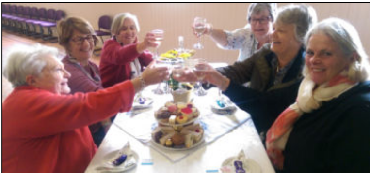
Each of the many tables had a committee member present who acted as hostess.

The committee look forward to many more special events. The feedback from the members following this event has been very positive.