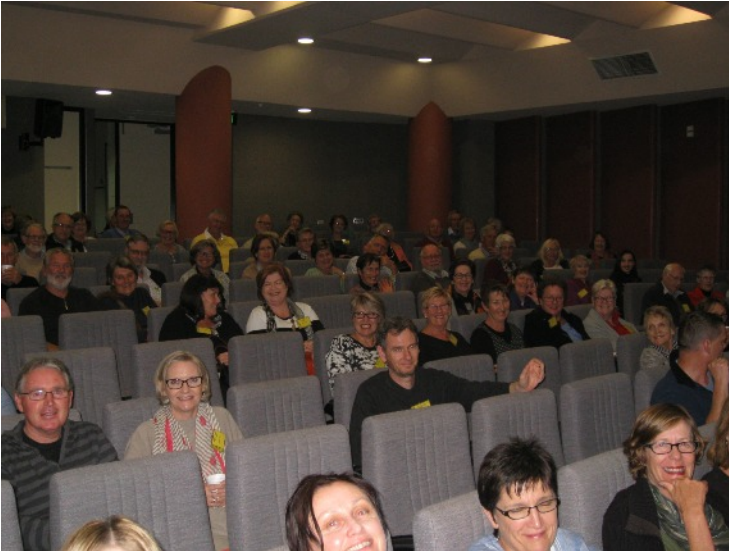
A good crowd for the Double bill and pizza night at Goulburn Valley Film Club