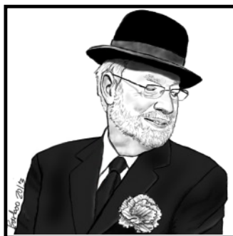
The FVFS is proud to have David Stratton as our patron.